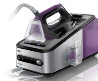
Braun Steam Generator Iron CareStyle 7