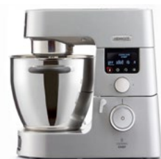
Kenwood Cooking Chef Gourmet