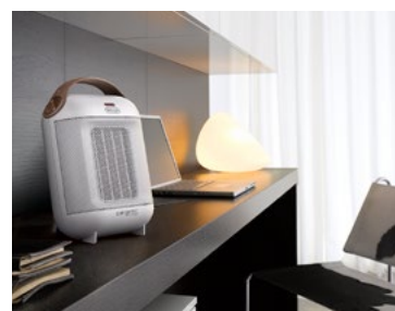
De'Longhi ceramic heater