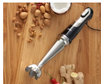
Braun hand blender MultiQuick 9