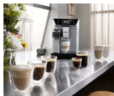
De'Longhi PrimaDonna Class