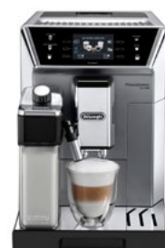
De'Longhi PrimaDonna Class