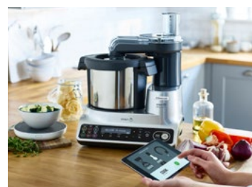
Kenwood kCook Multi Smart