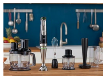
Braun MultiQuick 9 Set