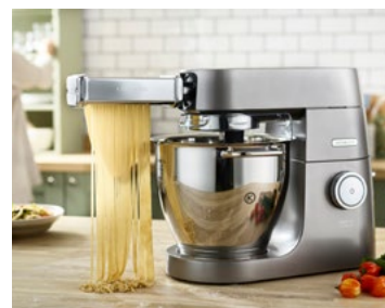
Kenwood Chef Titanium XL with new pasta attachment